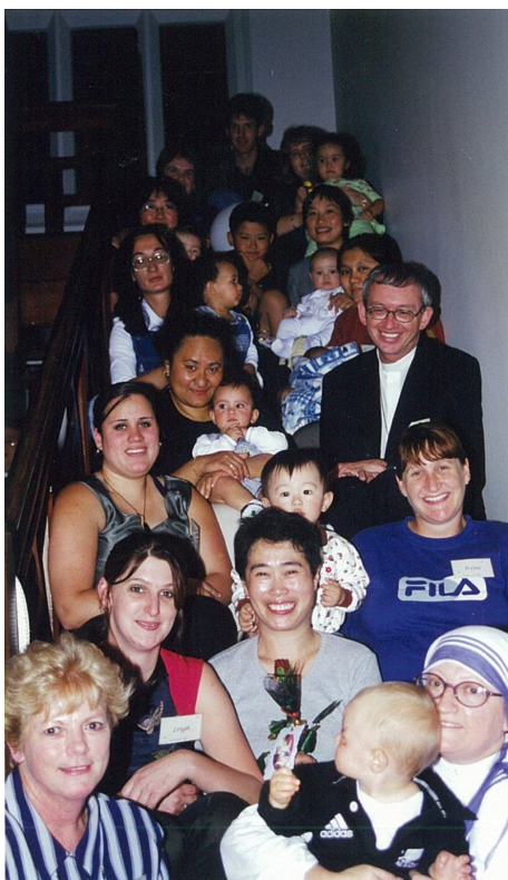
Top: Some of the team with mothers and babies served by FLI's pregnancy centre in earlier days.

In addition, the team at Gianna's Choice Pregnancy Options and Support work with medical professionals to ensure mothers and their preborn babies receive the best standard of medical care.